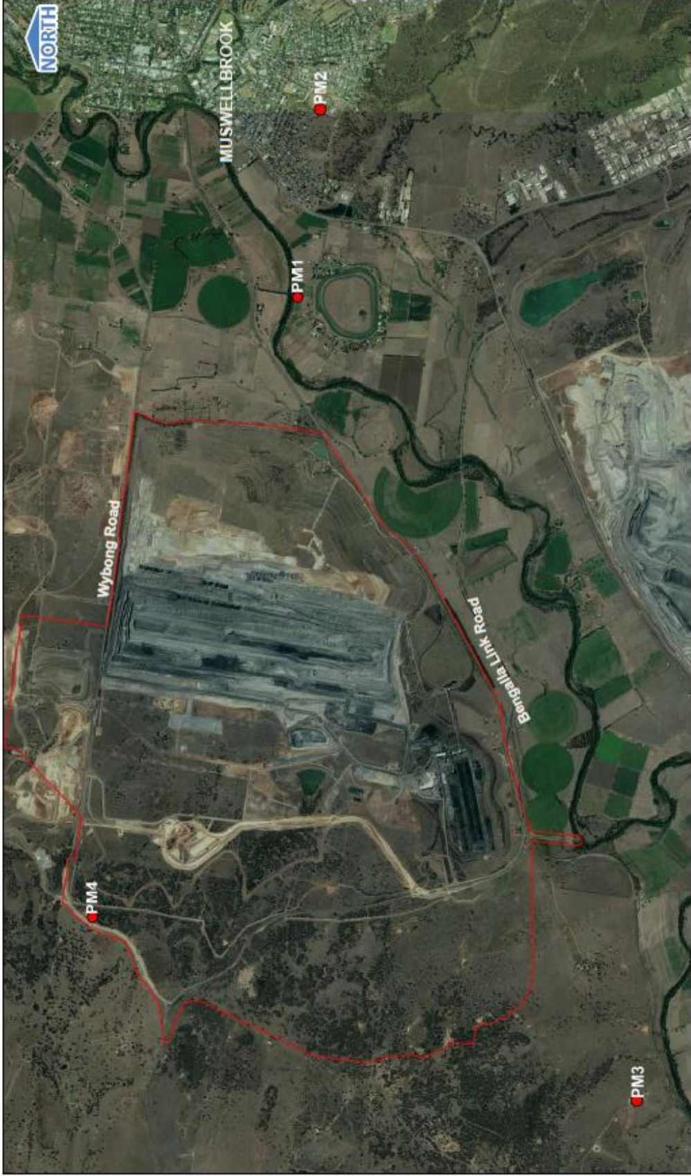
BENGALLA MINE PM10 Monitoring Locations