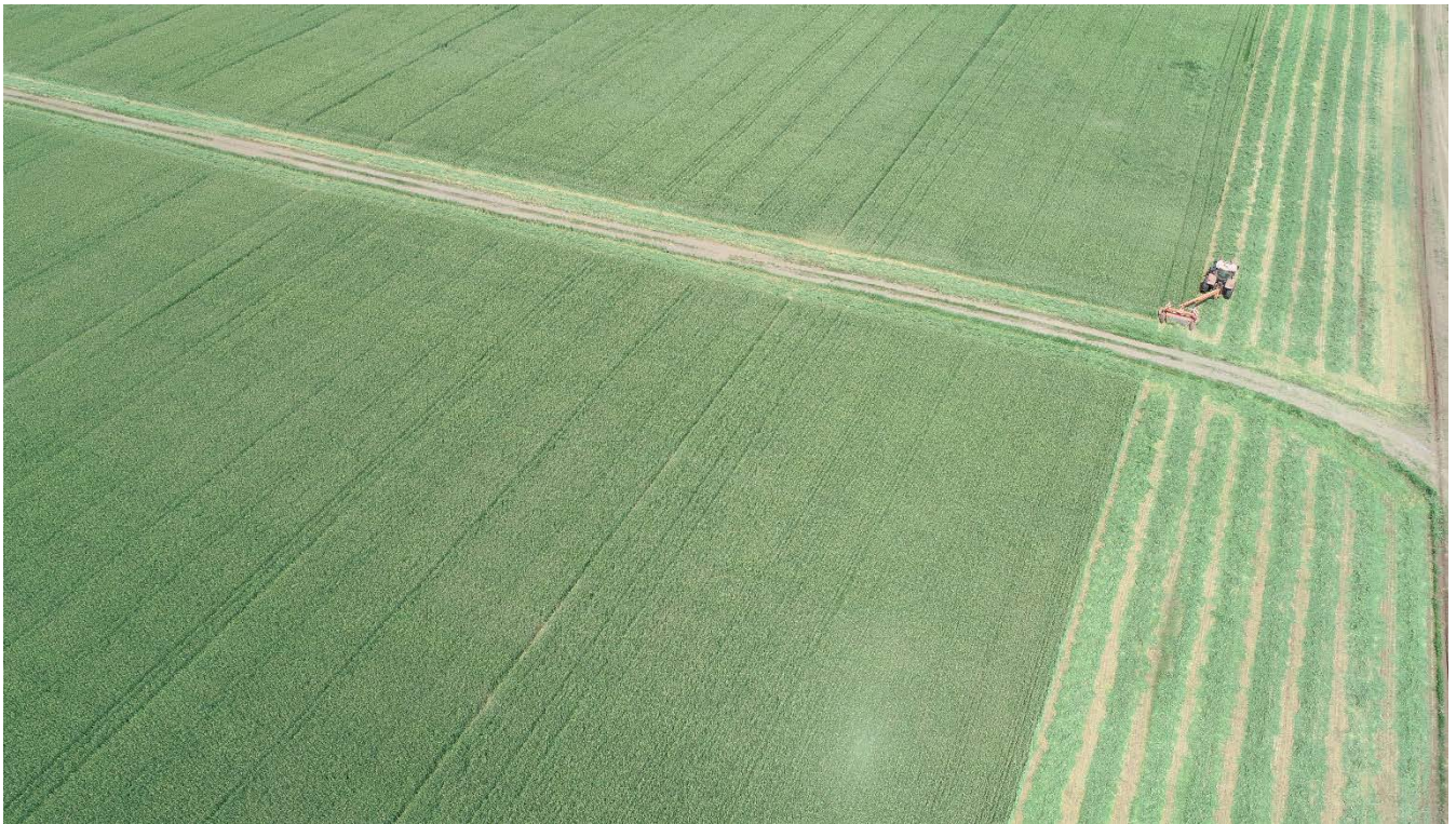
Barley Crop at Bengalla

Following the acquisition of a controlling interest in Bengalla, New Hope's land management experience is being applied to the active management of agricultural land surrounding the Bengalla operation. Twenty six hectares of barley was planted under the newly installed lateral irrigator, with harvesting planned for late October.